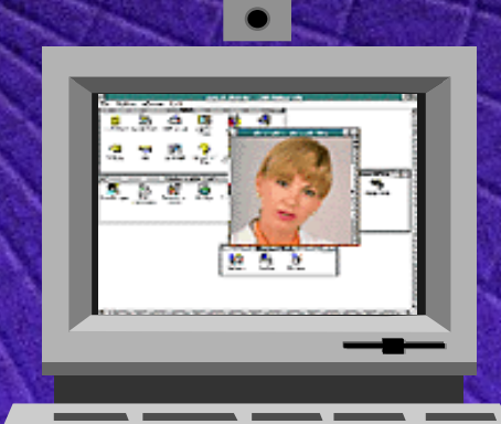
High-quality video and graphics