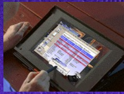
Voice/ handwriting input