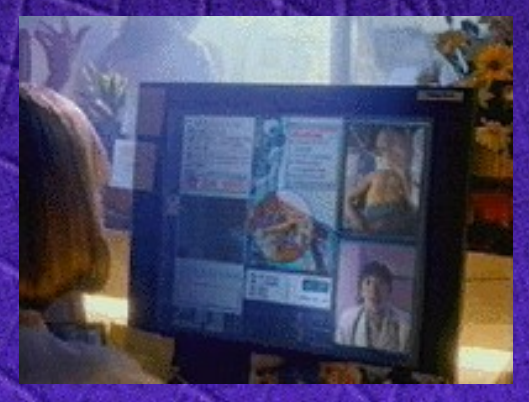
Flat, highresolution screens